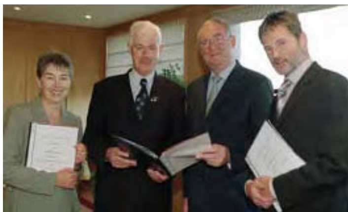
Mr Joe Walsh, former Minister of Agriculture and Food, with Ms A. McCarthy, ISPCA, Mr M.Flynn, IFA and Mr S. O'Laoide, Veterinary Ireland, at the launch of the Collaborative Early Warning Intervention System - September 2004

A Working Group on Co-operation was established to organise a structure between the different groups liaising together. The main aim of the group is to put together a more formal structure on a county-by-county basis to deal with cruelty cases at a local/county level and to acknowledge the need for a voluntary alarm system that could get the ethos across e.g. if there are social problems, it may lead to animals being neglected. Following on this in September 2004 the Working Group launched the Principles and Structure for DAF/IFA/ISPCA Collaborative Early Warning/Intervention System for Animal Welfare Cases (EWS) .