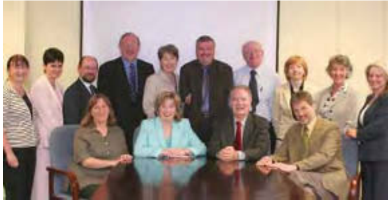
Members of FAWAC with Minister for Agriculture and Food, Ms Mary Coughlan T.D.