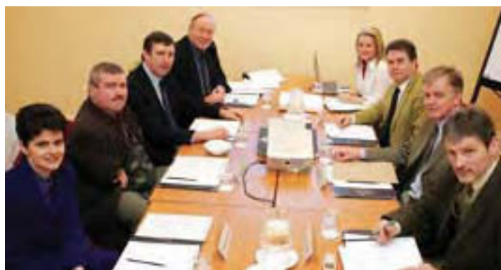
Some members of Working Group on Veterinary Medicines

It was agreed that the non-availability of certain medicines was having a negative impact on the welfare of farm animals in some cases. The Working Group on Veterinary Medicines was established to discuss this matter and report to the Council.