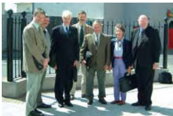
Some members of the Sub-Committee with responsibility for The Education Programme

Following submissions from each Council Member, it was decided that the work programme should include a Sub-Committee on Education, to compile guidelines on welfare codes for sheep, dairy and beef farmers.