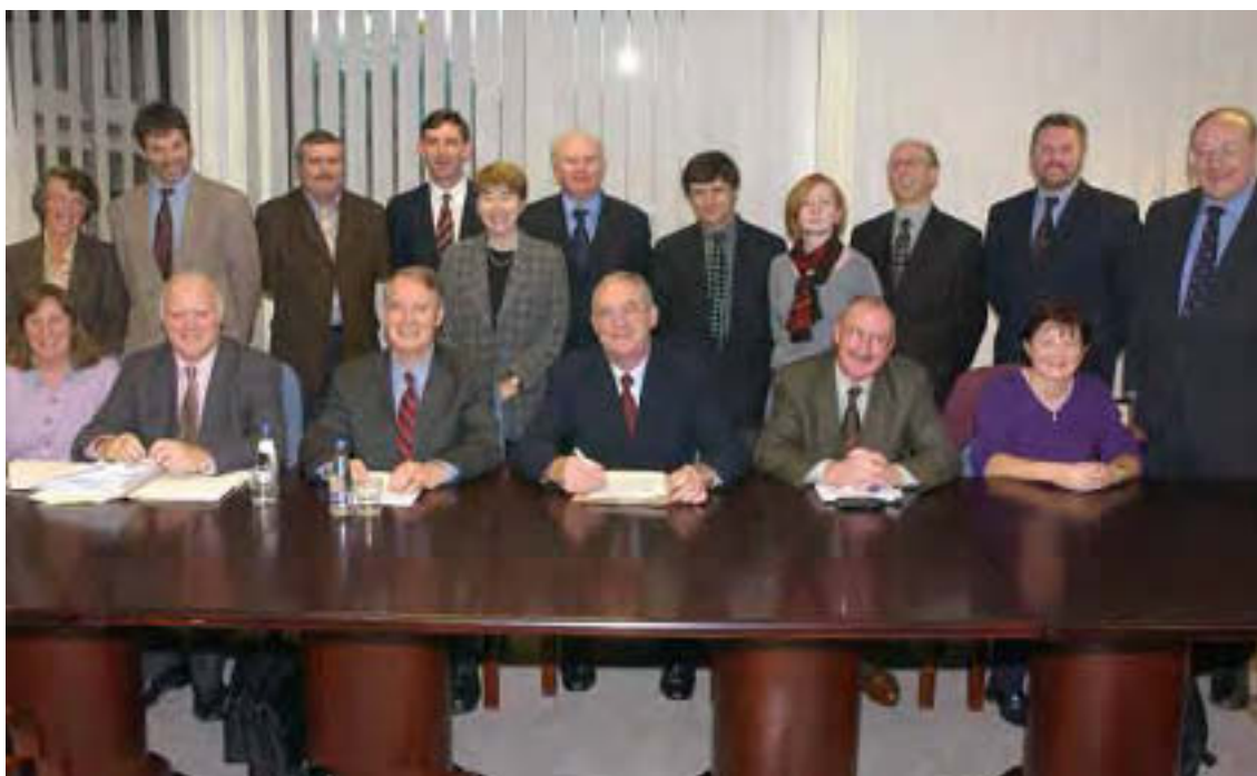
Inaugural meeting of the Farm Animal Welfare Advisory Council - November 2002