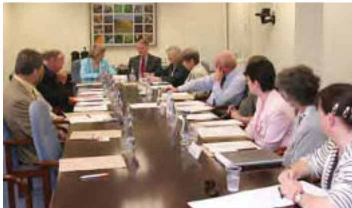
Ms Mary Coughlan T.D., Minister for Agriculture and Food, addresses FAWAC meeting

As required to consider specific proposals and in any event at least three times a year. Following the inaugural meeting of Council in November 2002, six meetings were held in 2003 and a further six in 2004.